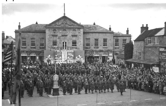
Wells Market Place, WW2