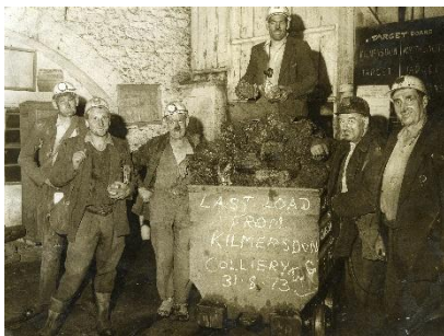
Last load Kilmersdon