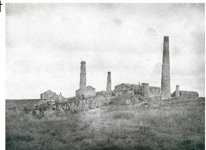
St. Cuthbert's Minery

and have now almost completely disappeared, leaving lost industrial landscapes around the county that give a clue as to what went on there. The book includes chapters on Iron Ore mining on the Brendon Hills and Exmoor; Lead Mining on the Mendip Hills; The Somerset Coalfield; Peat extraction on the Somerset Levels; Copper extraction on the Quantocks; Oil extraction on the Somerset coast; and Quarrying at places like Ham Hill in South Somerset and around Bath.